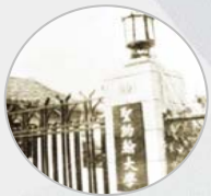
St. John's University School of Medicine