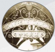
Aurora University School of Medicine