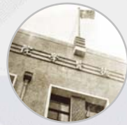
Tong-De Medical College